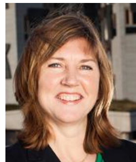
Alison Johnstone MSP

Member for: Lothian Party: Scottish Green Party