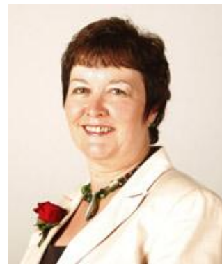
Rhoda Grant MSP Member for: Highlands and Islands Party: Scottish Labour