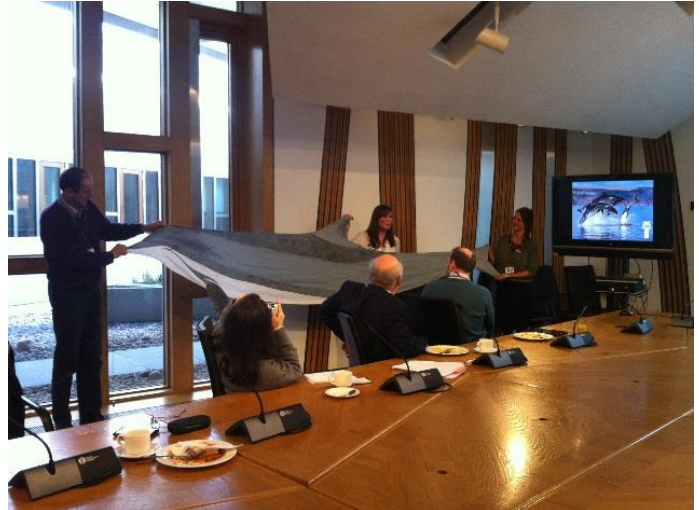
2 Whale and Dolphin Around Scotland Seminar

"I particular enjoyed seeing /hearing the short talks in the lunch time seminar. These provided a great way of seeing what other organisations are doing / triggering ideas for linking up projects."