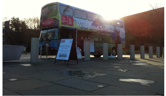
1 Wild About Scotland bus

The Drop-in Session were conceived as a way for all LINK members to be able to participate in SEW without needing to fit into set parameters fit by seminar topics. The Drop-in Session was to get members speaking directly to MSPs on topics or issues directly relating to their organization without the time constraints that a networking event such as the Evening Reception offers. The Drop-in Session was held in Parliament, in a meeting room both accessible to MSPs and the public. It ran from Monday to Thursday 9am to 5pm. The Drop-in Session was well attended by members with 18 members taking part, including Marine Conservation Society bringing in a live touch tank and the Royal Zoological Society of Scotland having their double decker education bus, Wild About Scotland, parked outside Parliament.