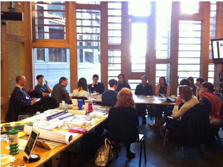
3 Urban Seminar meet to write guidance