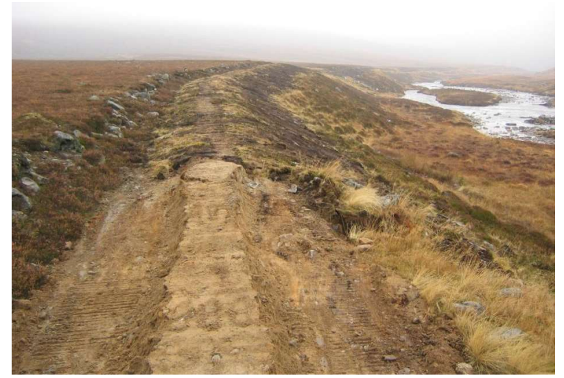
Glen Dee, former vehicle track after and during restoration back to footpath width.

9. Removal of unlawful tracks following enforcement action, or to rectify past damage, is challenging, costly and time-consuming.