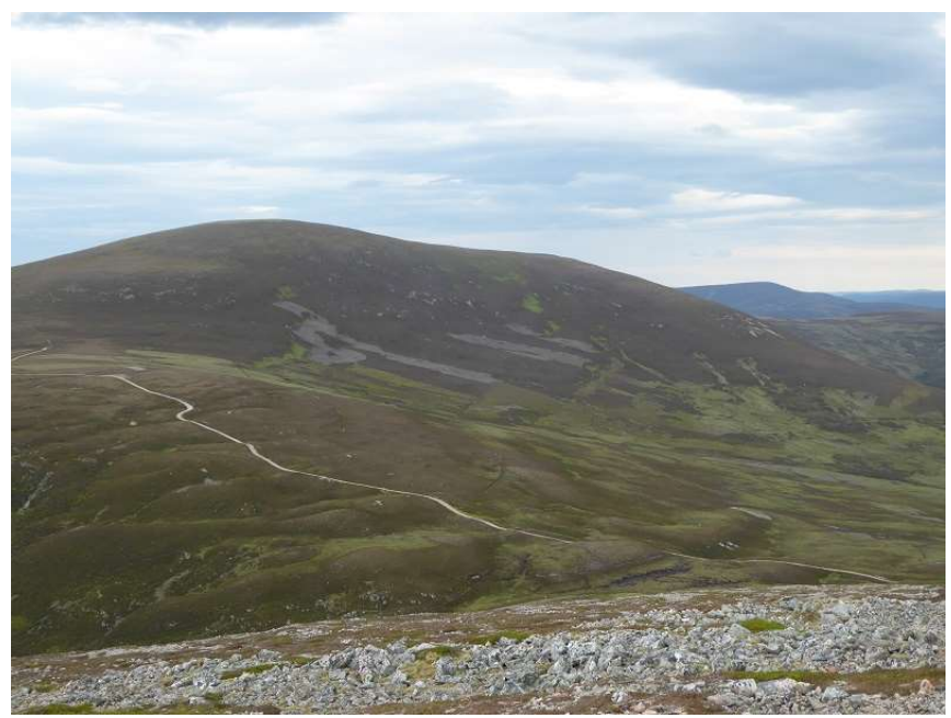
Culardoch, Cairngorms National Park

19. The Campaign has been publicised through the websites of member bodies, other supporters and the outdoor media. It has secured media coverage through a variety of channels leading to discussion, public engagement and support. Copies of Campaign submissions, correspondence and media coverage can be viewed on the Campaign's website.<sup>11</sup>