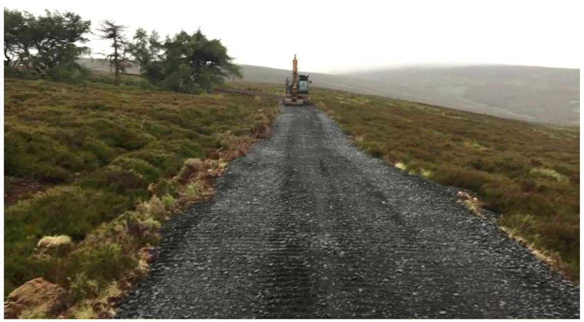
Borestane, Pentland Hills Regional Park, summer 2017. Work considered to be "maintenance/repair" not requiring Prior Notification