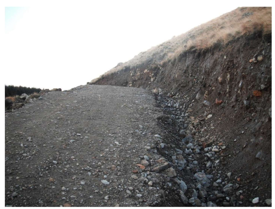
Forestry-related track of concern in Glen Clova, encountered by hillwalker (November 2017) but later found to pre-date the Prior Notification system