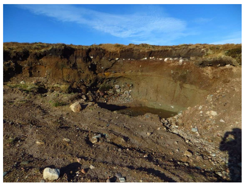
Long-standing track and borrow pit continuing to cause problems – Kervaig, Sutherland, March 2017

6. Despite being specifically targeted at agriculture and forestry, the legislation creating Permitted Development Rights did not adequately define forestry or agriculture purposes. This has made it possible for landowners to claim agricultural use and benefit from Permitted Development Rights to construct tracks which are, in fact, primarily for field sports as it can be difficult for planning authorities to challenge or disprove their claims that the tracks are required primarily for agricultural purposes.