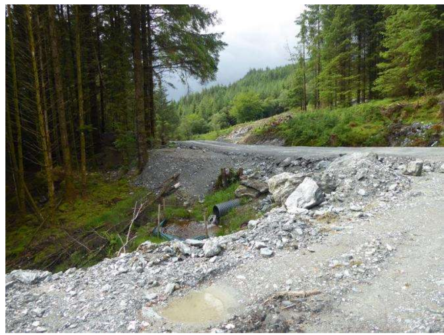
Coilessan Glen forestry track: restoration anticipated