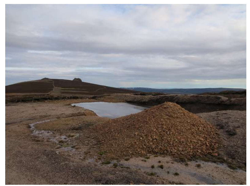
Near Clachnaben, Glen Dye, Aberdeenshire, 2017

1. For decades environmental and recreation groups have had concerns about the impact of and extent of vehicle tracks in Scotland's uplands, including in Scotland's National Parks and even to the summits of popular Munros.