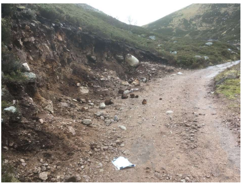
Loch Muick, Cairngorms National Park, December 2016

7. Due to the devastating effectiveness of modern machinery, tracks are often used to completely change the character and purpose of many old historical paths that have existed in the Scottish hills and glens for centuries. Some of these are old stalkers' paths and others have provided through routes for locals and visitors alike. From information sent to the Campaign by members of the public and from its own observations, it has been found that many of these paths are being altered by estates under Permitted Development Rights. If a Prior Notification is submitted, the applicant tends to claim "restoration" or "maintenance", whereas what is happening on the ground can only be described as the destruction and loss of an historical artefact.