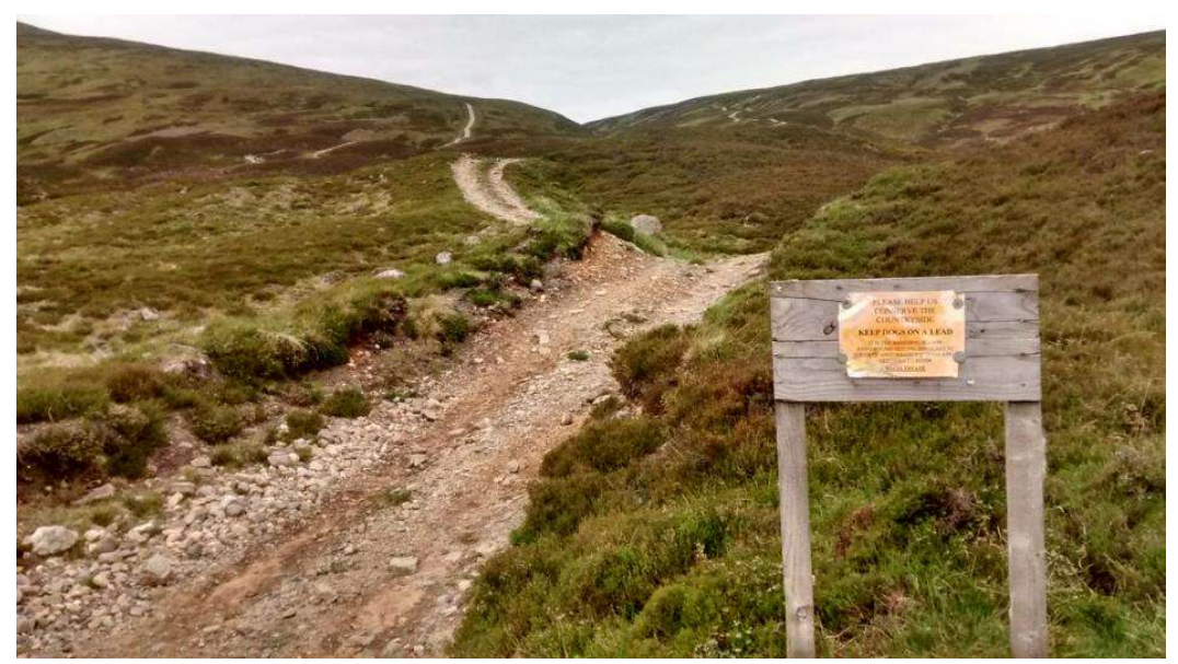
Sign by track at Drumochter urging walkers to help conserve the countryside, photo taken June 2017