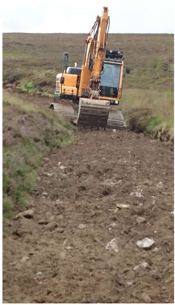
Maintenance/repair – or more substantial upgrade requiring Prior Notification? Glen Clova, summer 2017.