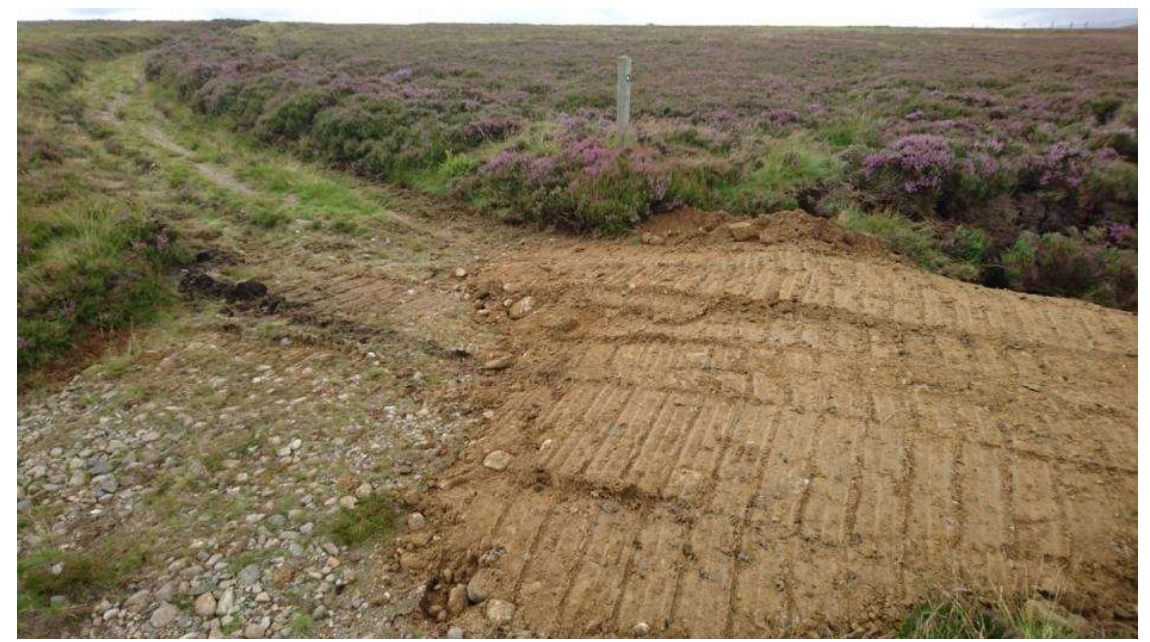
Maintenance/repair – or more substantial upgrade requiring Prior Notification? Glen Clova, summer 2017. Note Right of Way sign in background.

8. The following Case Studies illustrate some of the difficulties that can be encountered in the assessment of whether a Prior Notification is required or a track is merely undergoing small scale repairs or maintenance.