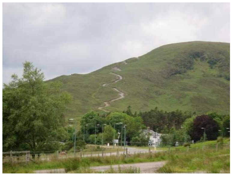
Track at Ledgowan, Achnasheen; photographed June 2017; more than five years after construction it remains highly intrusive in this sensitive landscape

13. Following this campaign activity, a Scottish Government consultation on Permitted Development Rights was held in 2011 which led to a further consultation<sup>6</sup>, in 2012, recommending the removal of Permitted Development Rights, given the "compelling evidence" of the damage caused by tracks provided by respondents to the first consultation. Unfortunately, the Government later changed its mind on this issue and called for more evidence to be provided.