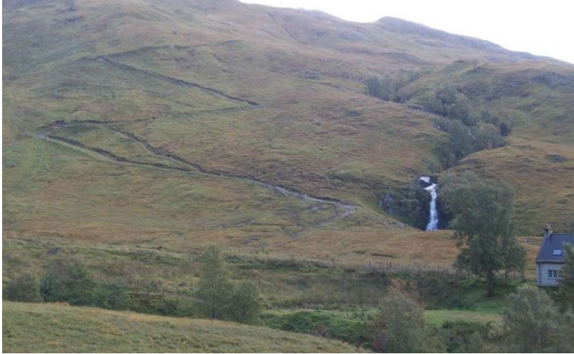
Long-standing track, Iron Lodge, Glen Elchaig, Wester Ross – photographed October 2015. Images on <a href="https://www.qeograph.org.uk/photo/5193548">www.qeograph.org.uk/photo/5193548</a> show this to be more than 25 years' old; note the short cut that has been created.

8. Tracks may never "blend in", even after decades, and some cause long-term problems with vegetation never recovering and ongoing erosion.