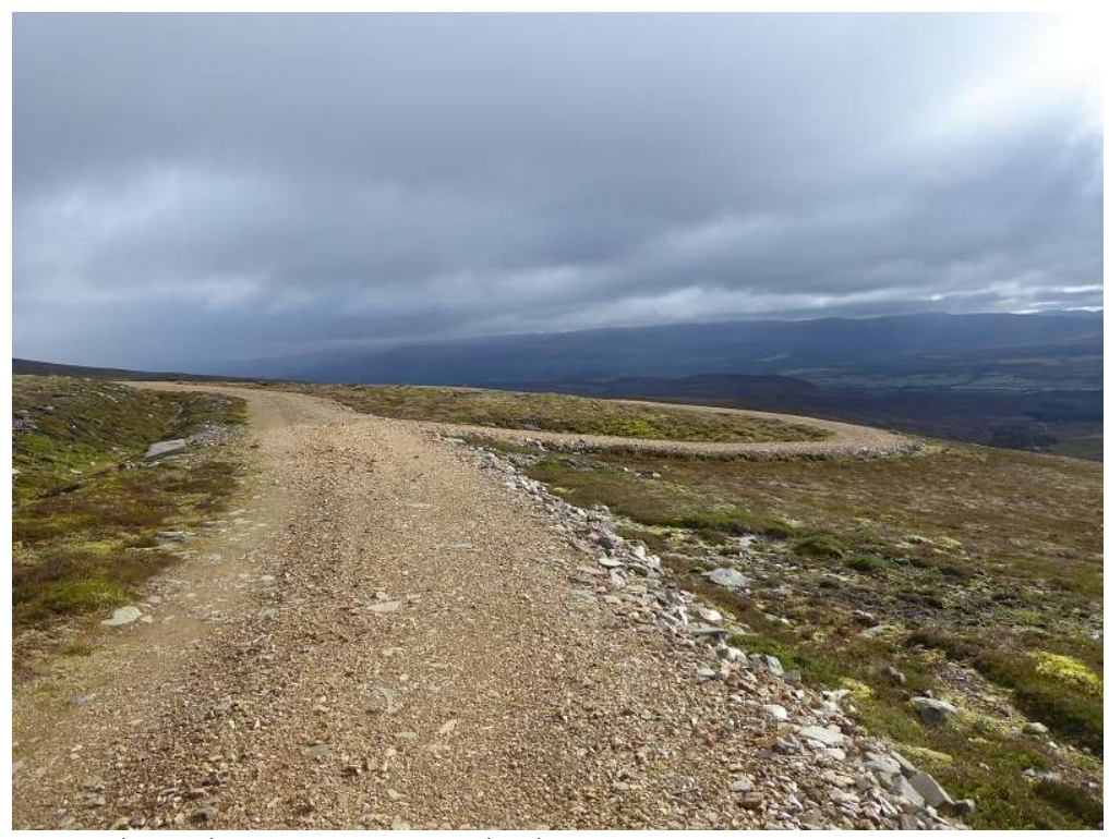
Carn an Fhreiceadain, Cairngorms National Park