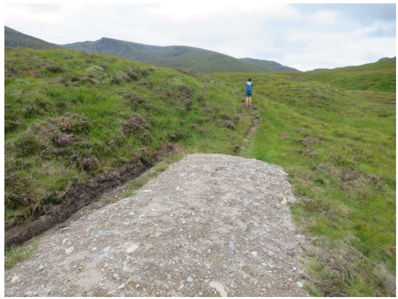
Ben Alder hills - track encountered by hillwalkers and assumed to be relatively recently constructed: planning status unknown

1. For decades environmental and recreation groups have had concerns about the impact of and extent of vehicle tracks in Scotland's uplands, including in Scotland's National Parks and even to the summits of popular Munros.