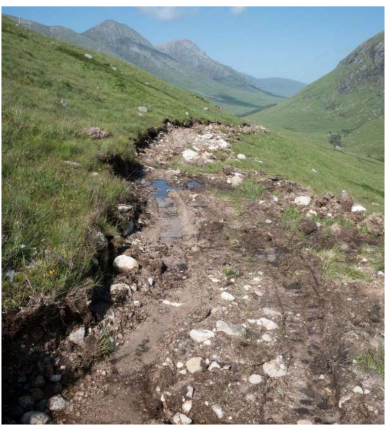
Glen Etive, summer 2017 - the Campaign received reports of a possible new and unlawful track west of the Allt a'Chaorainn. The Campaign was unable to find any record of a planning application for this track (a full planning application would have been needed owing to the site being within a National Scenic Area). The Campaign has asked Highland Council to investigate.

1. It is difficult to comment on the extent to which track construction and work, which should be notified to the planning authorities, is carried out without reference to the Prior Notification system (as is also true for tracks which should go through the full planning application process). Potentially unlawful works may only come to light some years after construction has taken place owing to the remote locations where agricultural and forestry tracks can be sited, with hillwalkers generally the only people likely to report possible new tracks or work they are concerned about. By the time such reports are received and investigated it can be difficult to prove or disprove the presence or otherwise of a pre-existing track and/or the extent to which work that has taken place could be considered to be genuine maintenance for which there does not need to be Prior Notification. It can also be very difficult to determine when track work was done, so there may also be uncertainty as to whether tracks have been constructed or upgraded since the introduction of the requirement for Prior Notification in 2014. During the monitoring period the Campaign received various reports, queries and photos from members of the public concerned about tracks they had encountered whilst in the hills.