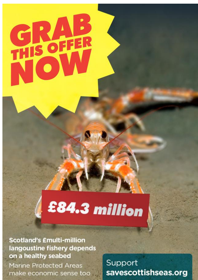
MTF posters highlight the economic as well as the environmental benefits of MPAs.

As Scotland's economy begins to float on the rising tide of developments offshore, the Scottish Government is duty-bound to put in place the 'sustainability architecture' for these marine industries.