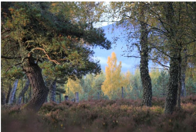
An Camas Mor site proposed for 1500 houses

This challenge comes in the year of ‘Natural Scotland’. It also comes soon after the National Geographic magazine declared the Cairngorms, the only British entry, to be in the Top 50 of the World’s Last great places, along with such locations as Madagascar and the Gobi desert. Before the judgement from the inner house the CNPA will have in post a new Chief Executive, Grant Moir.