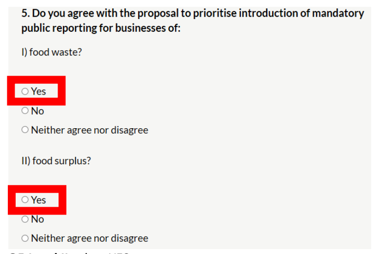
Q5 I and II select YES

4. To strengthen monitoring, measurement and reporting of waste across all sectors, do you agree with the principle that Scottish Ministers should have the power to require mandatory public reporting of: I) business waste? ○ Yes ○ No O Neither agree nor disagree II) business surplus? ○ Yes O Neither agree nor disagree Q4 I and II select YES