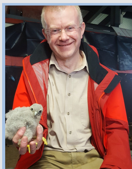
John Mason MSP, Species Champion for kestrel helped ring kestrel chicks at Drumpellier Country Park