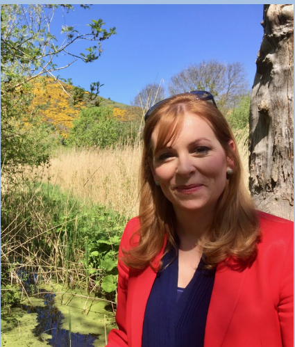
Ash Denham MSP, Species Champion for ash tree visited Bawsinch and Duddingston nature reserve