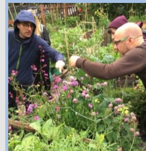
Patrick Harvie MSP, Species Champion for Red mason bee looking for his species at Woodland Garden in Glasgow