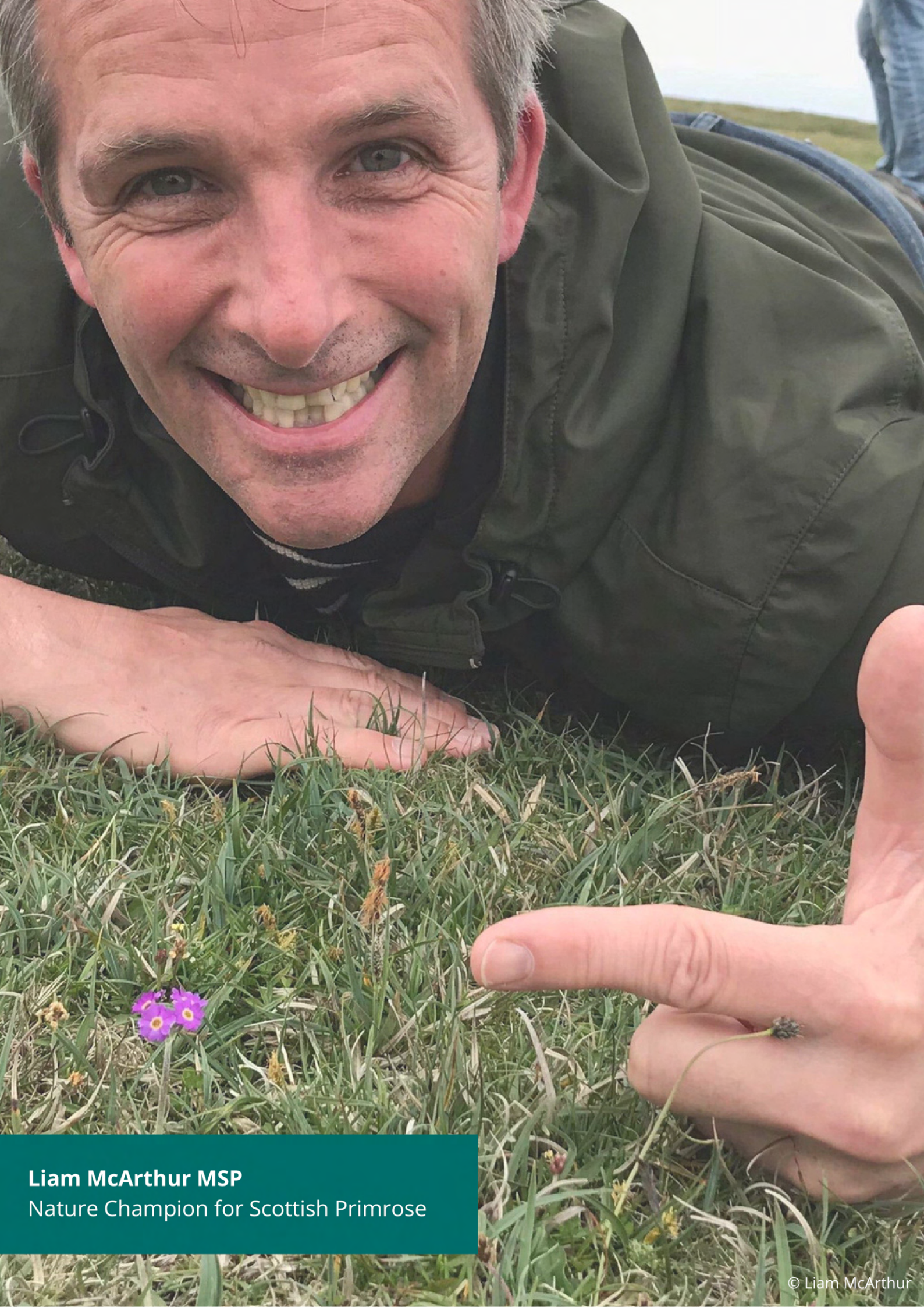
Liam McArthur MSP Nature Champion for Scottish Primrose