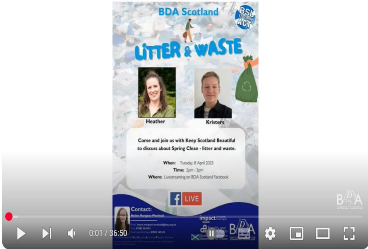
Litter and Waste Spring Clean 2025